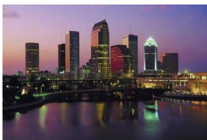
Tampa offers an eclectic array of restaurants.

The city of Tampa lies along Tampa Bay, amidst Florida's west coast and less than 25 miles from St. Petersburg. Tampa features more than 330,000 residents, with close to 20 percent deriving from Latino origin. As a result, the city plays host to numerous eclectic restaurants, including a mixture of high-end and casual eateries, many of which feature full bars. Revered travel guides like Frommers, Fodors and Gayot provide the highest ratings to these 10 Tampa restaurants.